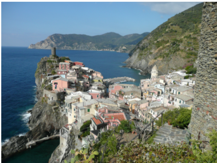
The Cinque Terre hiking trail gives you this spectacular view of Vernazza.

Club dei Borghi più belli d'Italia selects the 'Most Charming Villages in Italy'.