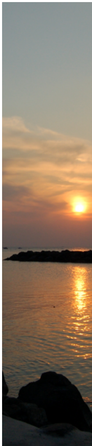
In Sorrento, the sunset seems to last forever.

the spirit of St. Francis himself. He's the patron saint of Italy and when you are in his home town, you not only learn his life's story but also feel his gentle presence. Assisi has a magnificent Basilica which is a must-see for the Giotto frescoes on its walls. Visit the many shops while you are here and be sure to stay for dinner.