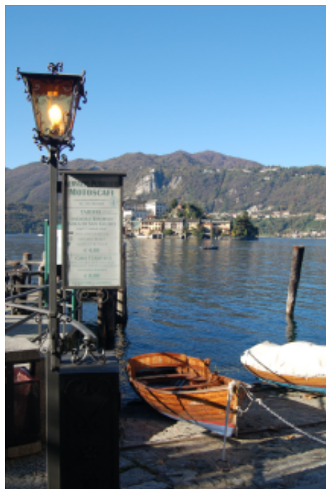
Lake Orta is 'the poets' lake'.

O kay, we're going. So where do we begin?